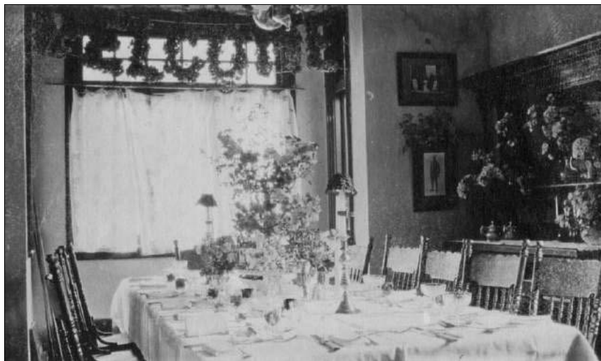
Welcome home for Christmas 1918—the decorated dining room.