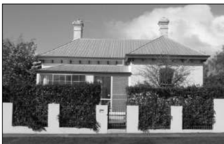
58 Gunn Street, Devonport