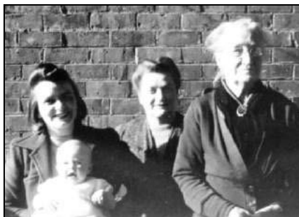
The four generations