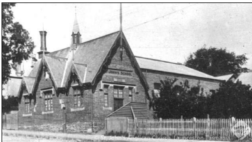
The school building in 1930