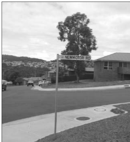
Newmotor Road on the Hillmorton Road corner

The Motor Road endures. Traces are still visible despite decades of bush-fires and neglect. As the suburbs encroach more and more of it is disappearing under bricks and bitumen, but in its honour one of the new streets now bears the name Newmotor Road.