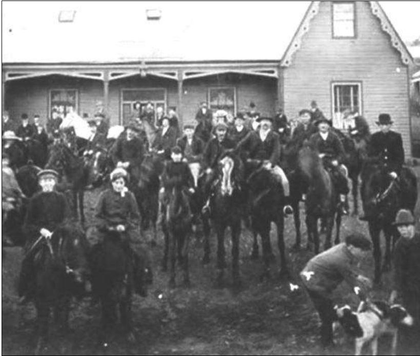
Ready for the Hunt— Bridge Hotel Forth

The hotel was a meeting place for the hunt club's departure and provided drinks and refreshments at the end of the meet to wash away the dust and to furnish comfortable surroundings for yarns of the hunt, horses and dogs.