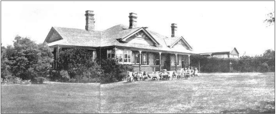
1917: St Margarets School Tasmanian Mail 14 June 1917