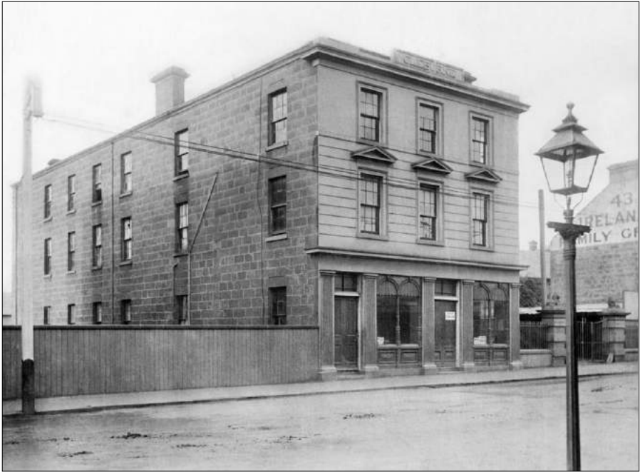
Cleburne House, Murray Street—before and after the fire