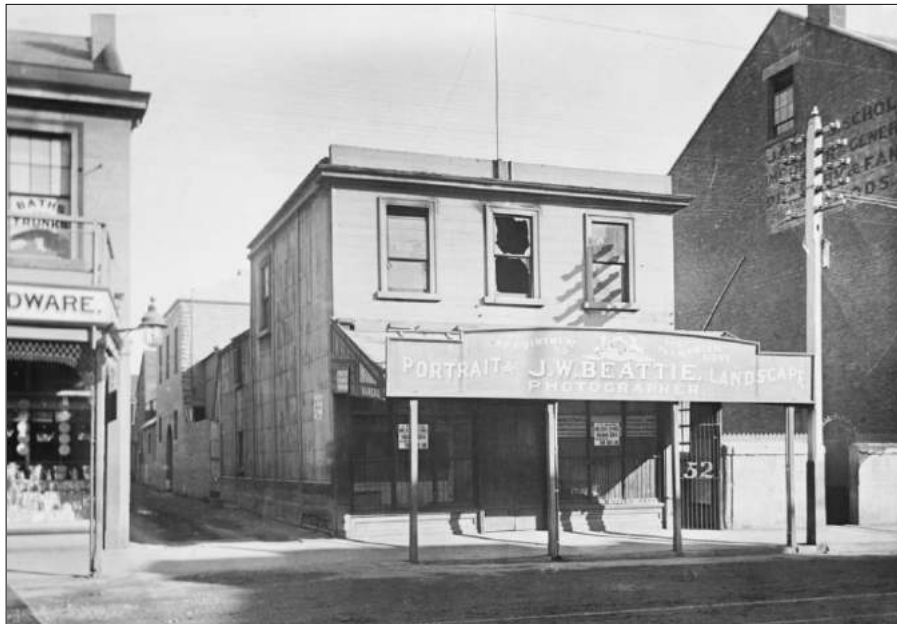
Beatties Studio Wellington Bridge, Elizabeth Street c. 1895