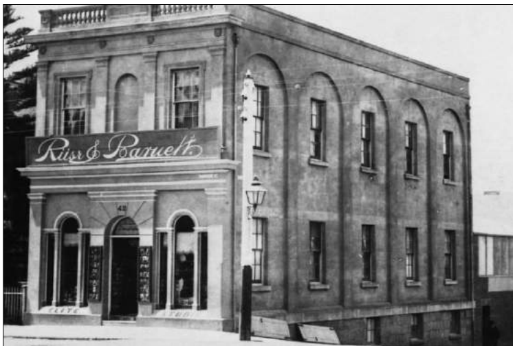
Riise and Barnetts Elite Studio, Macquarie Street Hobart

An expanded report from the (Zoom) August meeting of Hobart Branch.